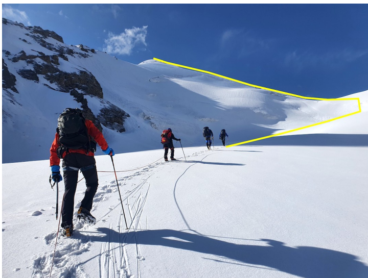
Climbing the 2021 route up Pik Skobolev West in the Kichik-Alai.