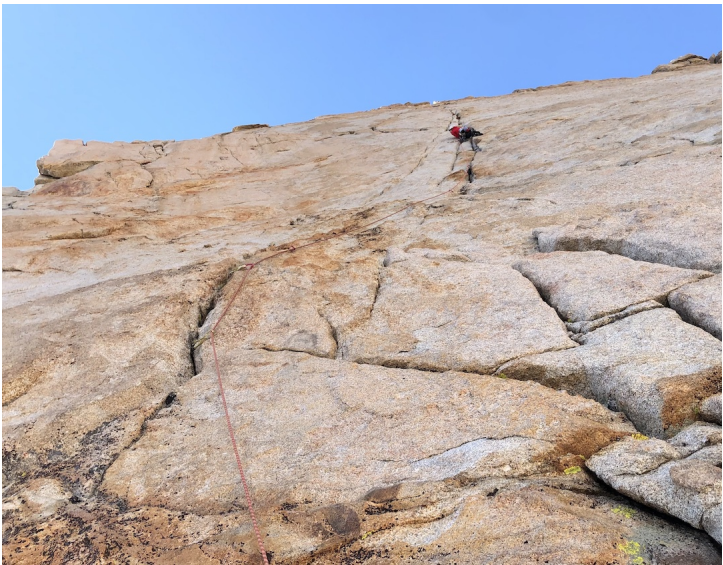
Lenore Sparks onsighting the 12a crux pitch of Donathan Mustache.