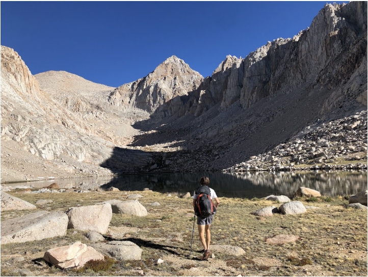
Approaching Marie Maynard Daly Peak. Primrose Lake is in the foreground.