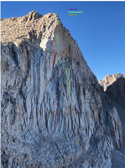
Photo-topo of the new routes on the south face of Marie Maynard Daly Peak. Purple: Oo-Da-Lilly. Green: Donathan Mustache. Yellow: Infinity Pool.