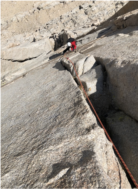
The Bighorn Splitter Pitch (pitch 3) of Donathan Mustache.