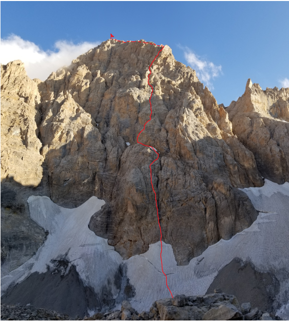
The Chaplynksky-Fomin-Todorenko line on the north face of Mt. Kaldı (3,734m).