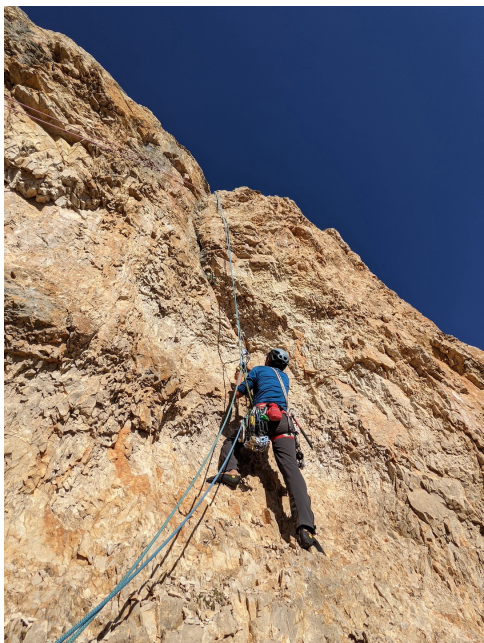
Seconding a pitch on Sessizlik, a variation on the northeast face of VayVay.