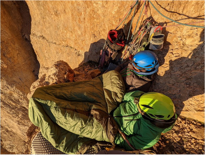
Bivouac on VayVay Mountain during the ascent of Sessizlik.