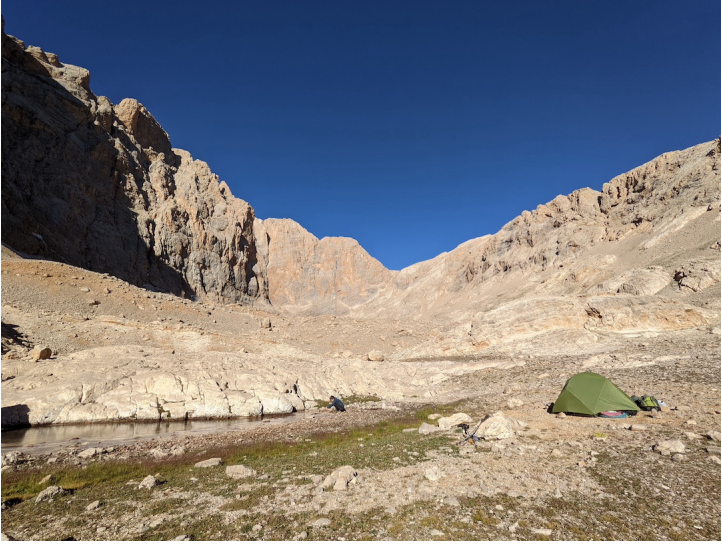
VayVay seen from camp.