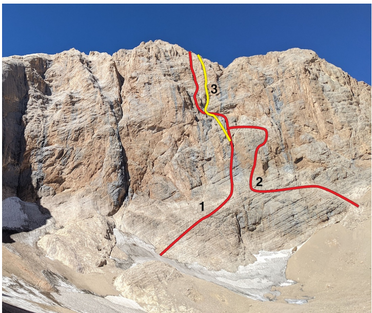
Northeast face of Vayvay. Nessuno (2012) is off-picture to the left. (1) Turkish line (1997). (2) Ceschia-Perotti Route (1986). (3) Sessizlik (2021).