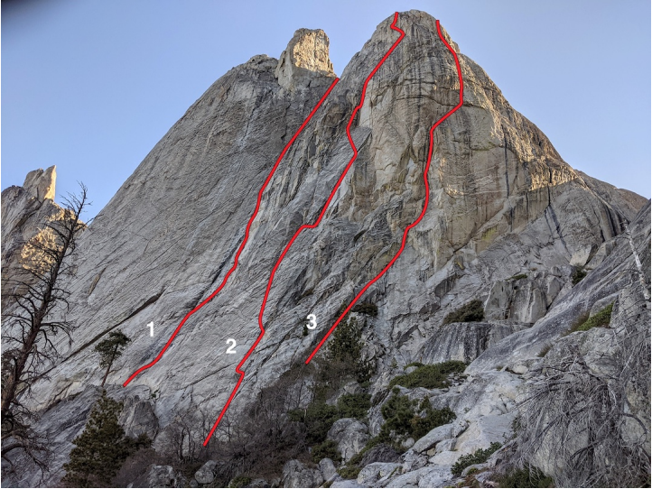
The west and south faces of the Axe, showing (1) Axes of Evil (7 pitches, 5.11-), (2) Tomahawk (8 pitches, 5.11), and (3) Golden Axe (6 pitches, 5.12-).