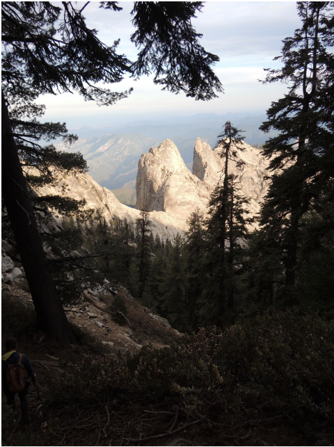
Upper Castle Rock Spires seen from the approach.