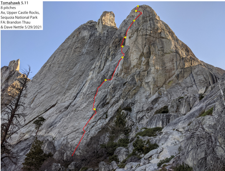
Photo-topo of Tomahawk on the Axe formation in Upper Castle Rock Spires.

Tomahawk 5.11 8 pitches Ax, Upper Castle Rocks, Sequoia National Park FA: Brandon Thau & Dave Nettle 5/29/2021