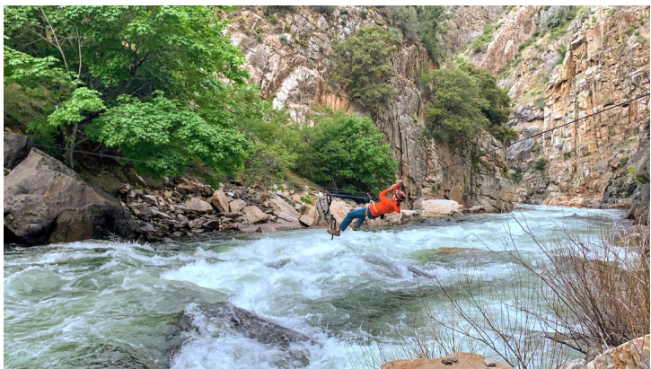
Crossing the Kings River.