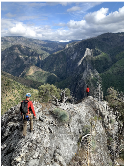
On top of the King Wall, looking at more marble cliffs above Boyden Cavern.