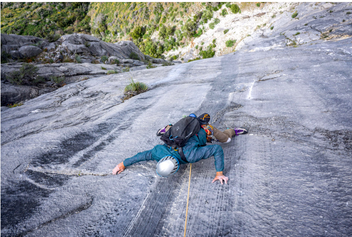
Following one of the upper pitches on Big White Spot, Kings Canyon.