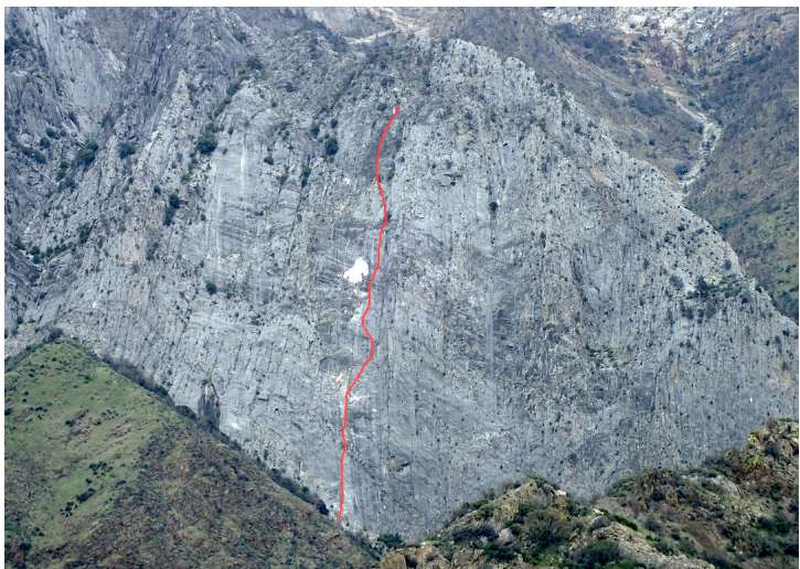
The King Wall in the Windy Cliffs of Kings Canyon, showing Big White Spot (10 pitches, 5.10+).