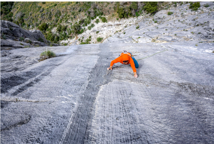
One of the upper pitches on Big White Spot, Kings Canyon.