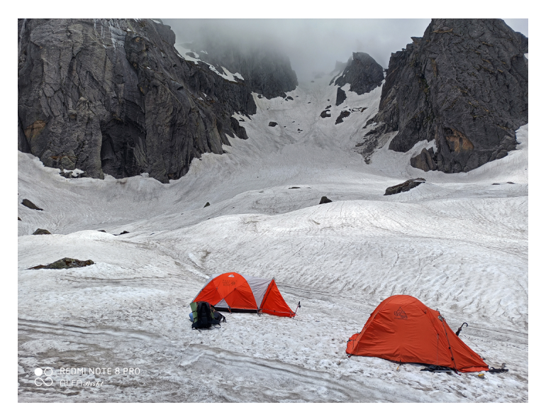
Summit camp at 4,387m and the broad snow couloir leading to the col west of the Harsil Horns.