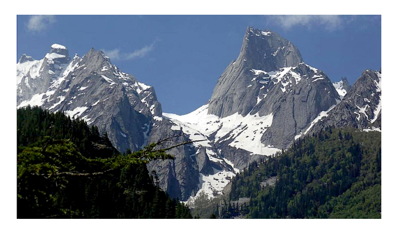
The Harsil Horns from the north. The west peak (right) was climbed in 2020 from the col to the west of the mountain (not visible).