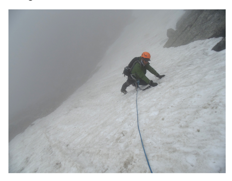
The climb to summit camp.