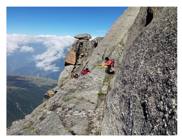
During the ascent of West Harsil Horn.