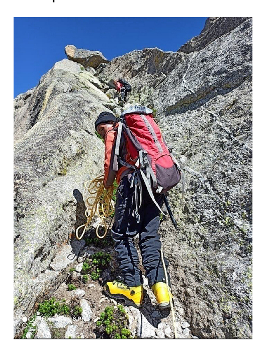
During the ascent of West Harsil Horn.