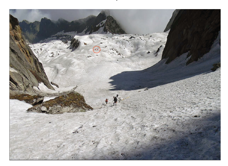
Descending the snow slope below the col west of Harsil Horn. The 2020 team's summit camp is circled.