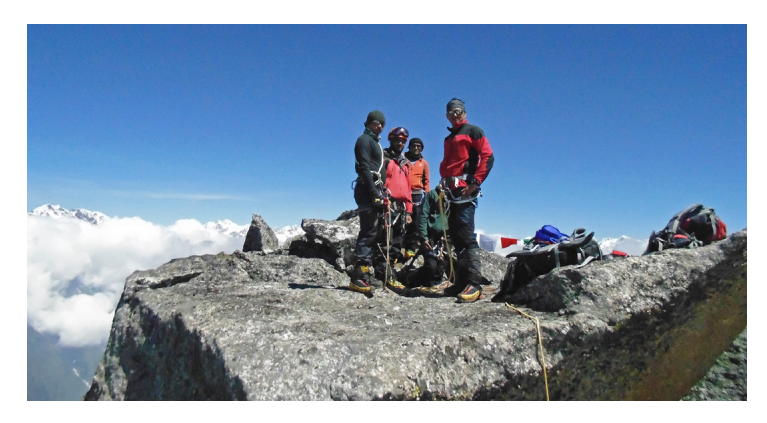
On top of West Harsil Horn.