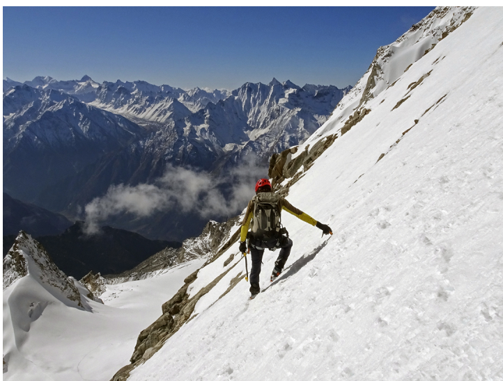
Gebhard Bendler on the lower southeast face of Devbhoomi during the first ascent. The Baspa Valley is below, and the nearer peaks on the south side are largely unnamed and rise to around 5,500m.