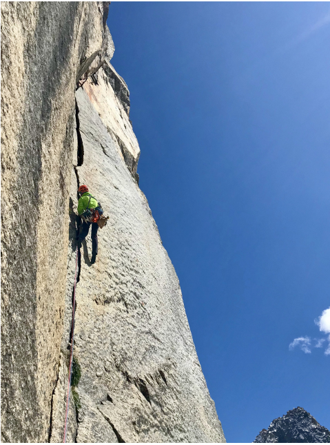
Pitch two (7a) of Rehab Line on Alpbandariol (ca 5,000m).