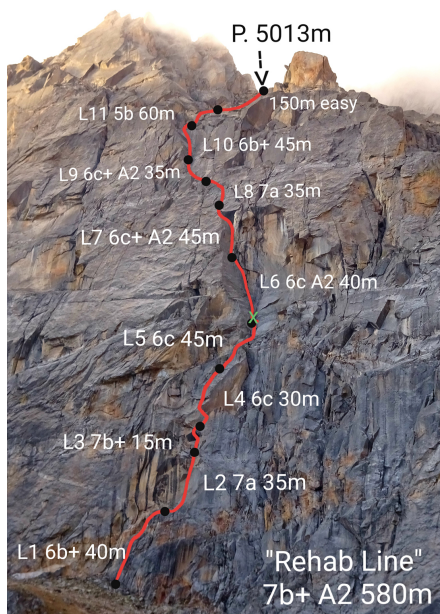
Rehab Line on the south face of Alpbandariol, a summit of around 5,000m north of the Rakcham Plateau.