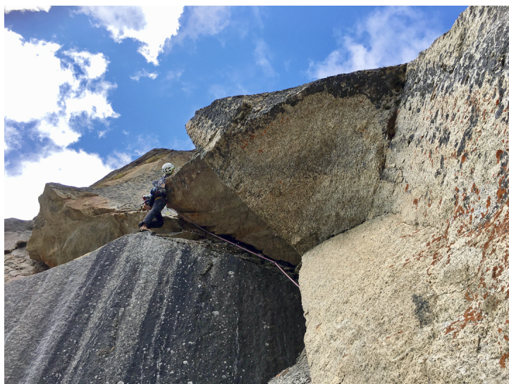
The crux pitch three (7b+) on Rehab Line on the south face of Alpbandariol, a summit of around 5,000m north of the Rakcham Plateau.