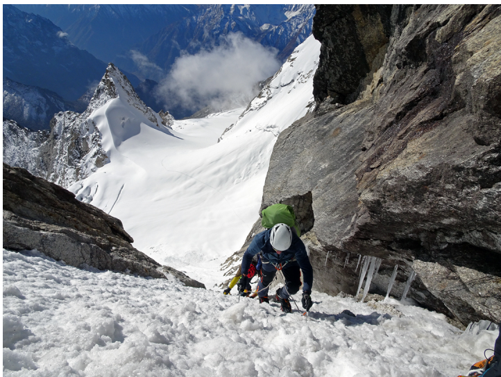
Climbing snow gullies on the southeast face of Devbhoomi during the first ascent.