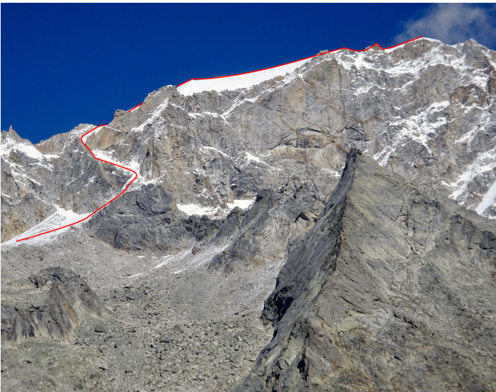
The southeast face and southwest ridge of Devbhoomi (6,057m).