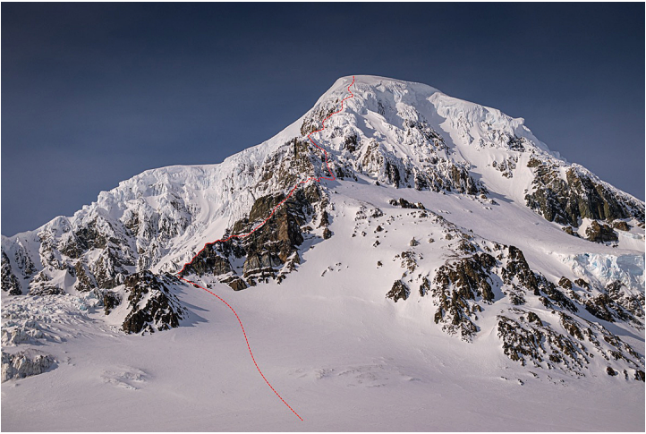
The northeast ridge of Mt. Gwendolyn, Adelaide Island.