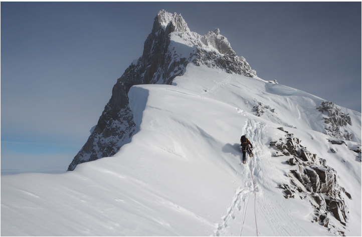
Sam Hunt on the east ridge of The Myth.