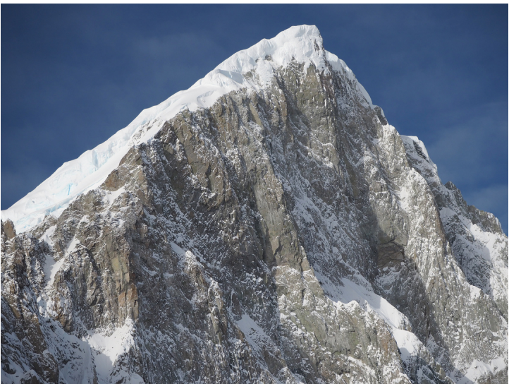
The top of the impressive and unclimbed west face of The Legend.