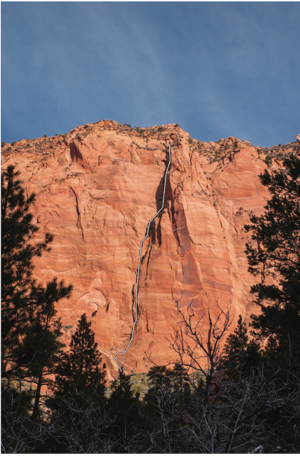
A portion of the south face of Beatty Point, showing the line of Big Game Hunter (1,100', 9 pitches, 5.12d), established in late 2019 and freed in early 2020 by Lane Mathis, Sam Stuckey, Collin Turbet and Dakota Walz.