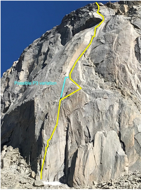
The line of Icarus (9 pitches, 5.11+) on Resolute Buttress in Cirque of the Sun.