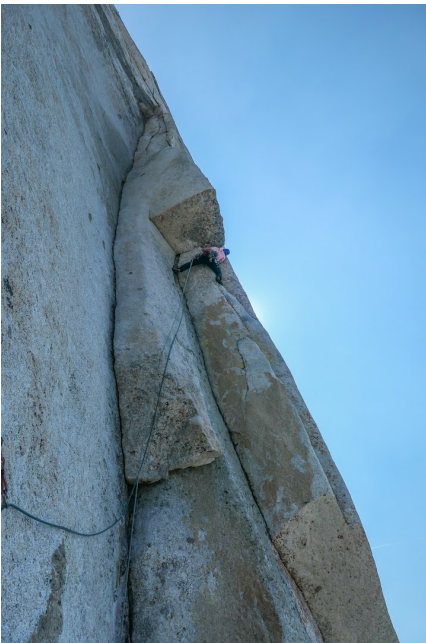
Brian Prince tackling steep corners during the first ascent of Locked & Loaded (1,100' climbing distance, 5.11a) on Locke Rock in the western Sierra.