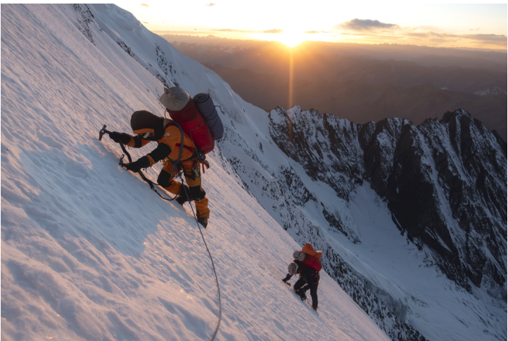
Yuikeung Ho and Xiaohua Yang approach the shoulder on the upper north ridge of Daddomain West during the second day of the climb.