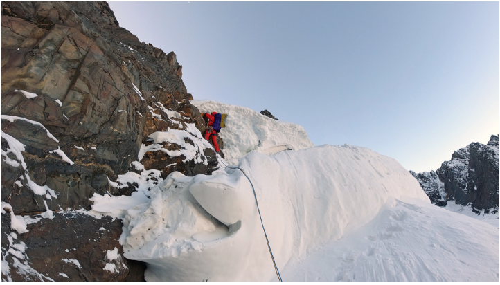
Siyuan Huang surmounts the bergschrund on the northwest face of Daddomain West.