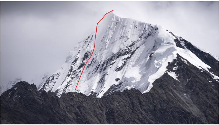
The top half of Good-bye Happiness on the northwest face of Daddomain West. The west ridge, on the right, was partially followed by New Zealanders in 2004 to make the first ascent of Daddomain (hidden beyond the top of Daddomain West).