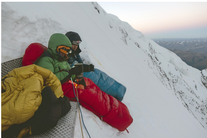
Yuikeung Ho and Xiaohua Yang at the first bivouac on the northwest face of Daddomain West.