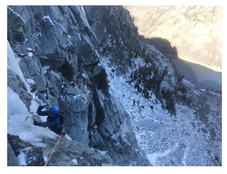
Matt Primomo topping out the second pitch during the first ascent of Arctic Axis (1,300', WI4+ M4+ R) on the northeast buttress of Axis Peak, in the Stuart Range of the North Cascades. Eightmile Lake is below.

Adam Butterfield leading the crux second pitch during the first ascent of Arctic Axis (1,300', WI4+ M4+ R) on the northeast buttress of Axis Peak, in the Stuart Range of the North Cascades.