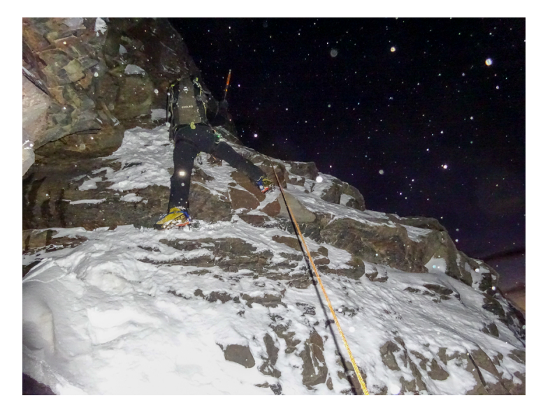
Aldo Coral seconding the first pitch of mixed climbing on the south face of Cerro Esmeralda.