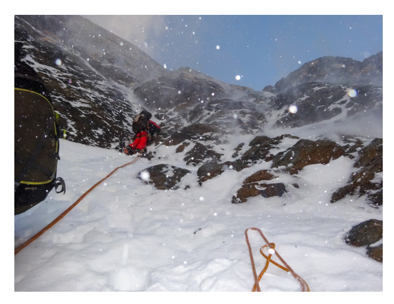
Nicolas Secul leading in the crux second rock band on the south face of Cerro Esmeralda.