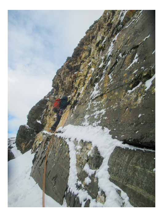
Seb Pelletti leading in the crux second rock band on the south face of Cerro Esmeralda.