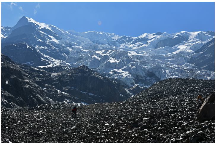
Ted Mueser approaching the glacier below the west face of Nevado Palqay.