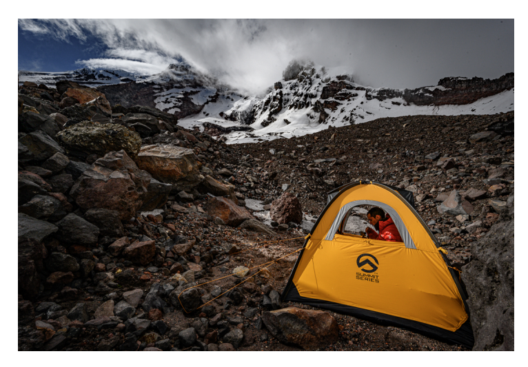
Felipe Proaño at camp below the southeast face of Chimborazo.