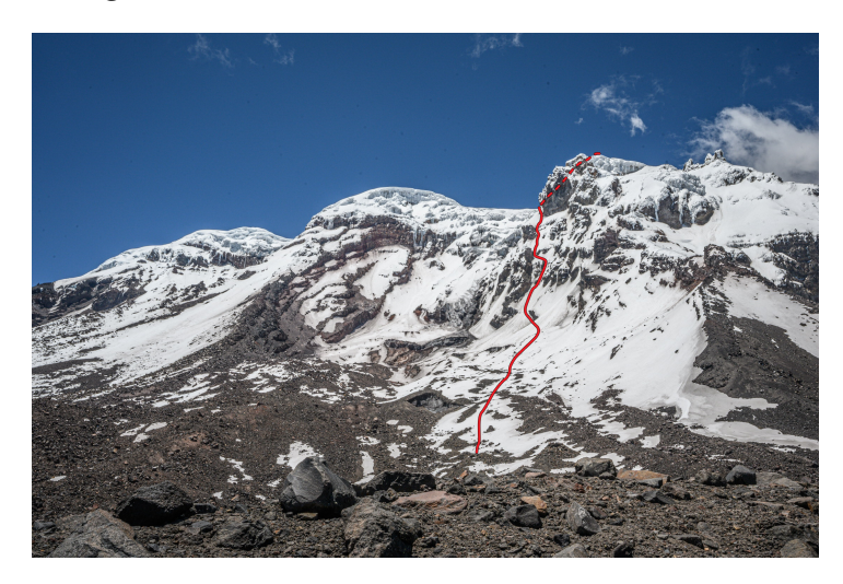
The route Paraphernalia (700m, TD AI4) on the southeast face of Chimborazo to its southeast summit (Pico Nicolas Martinez). Near the top, the route deviates toward the col between Politécnica (5,900m) and Pico Nicolas Martinez.