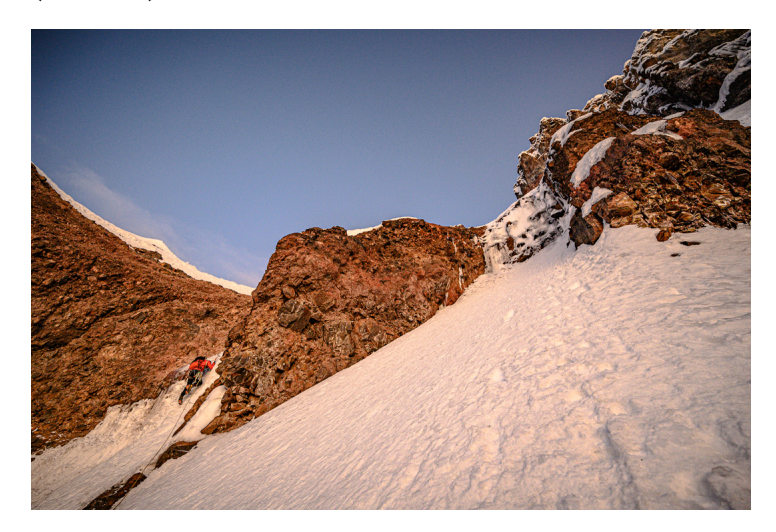
Felipe Proaño leading an ice runnel on Paraphernalia (700m, TD Al4) on the southeast face of Chimborazo.