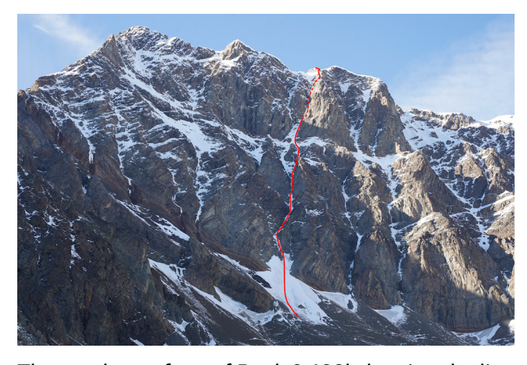
The southeast face of Peak 9,630' showing the line of DeWilde Style (700m, Al4+). The first ascensionists descended from the junction with the summit ridge due to unstable snow conditions.