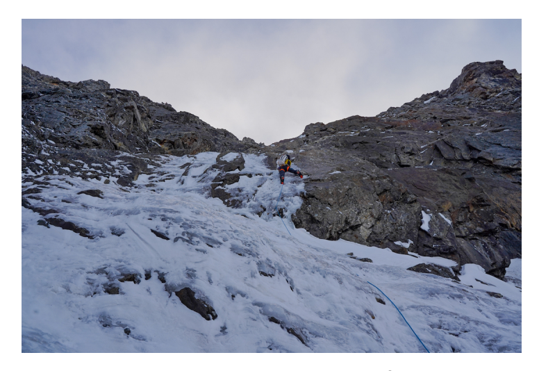
Austin Schmitz climbs through one of the routes ice cruxes during the first ascent of Longing for Light (800m, AI5 R) on the northeast shoulder of Mt. Moffit (13,020') in Alaska's Hayes Range. The team descended from the junction with the northeast ridge.