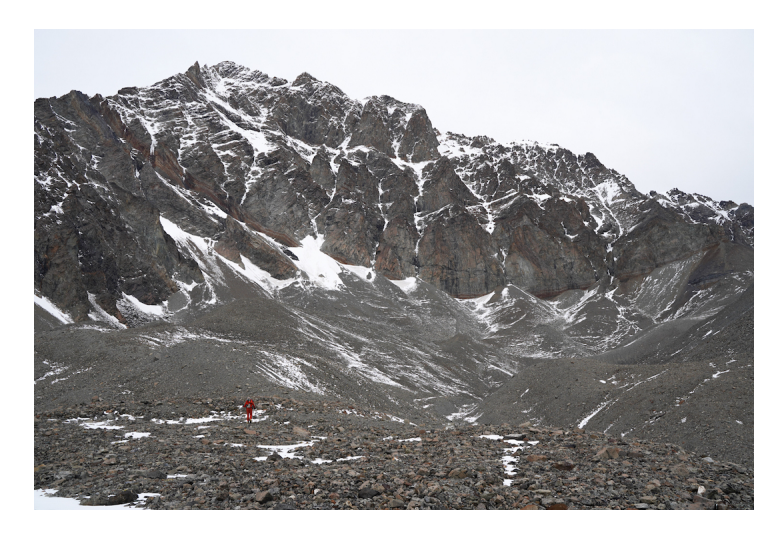
Ben Lieber on the approach to the southeast face of Peak 9,630' in Alaska's Hayes Range, in nearly snowless autumn condition.