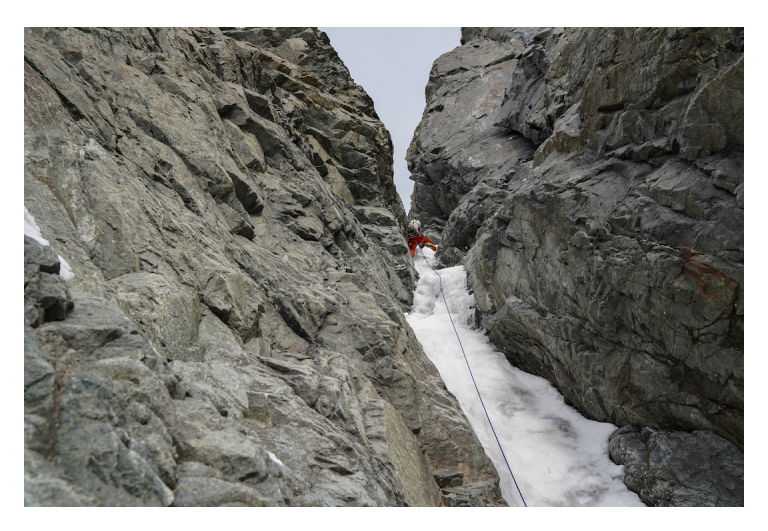
Ben Lieber leading through a long choke of steep ice during the first ascent of DeWilde Style (700m, Al4+) on the southeast face of Peak 9,630' in Alaska's Hayes Range.