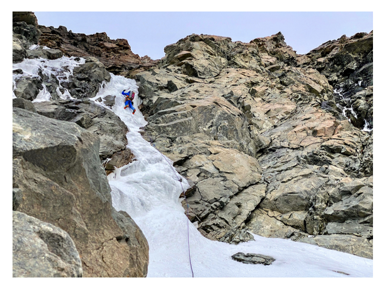
Alex Hansen leading a steep section of ice low on the face during the first ascent of DeWilde Style (700m, Al4+), on the southeast face of Peak 9,630' in Alaska's Hayes Range.