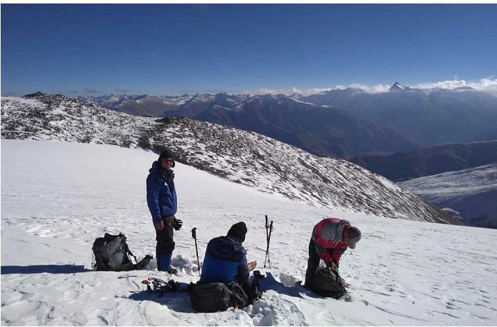
Looking northeast from high on Guide Ri, across the deep Indus Valley. The conspicuous pyramid on the right is Chakula (6,529m).