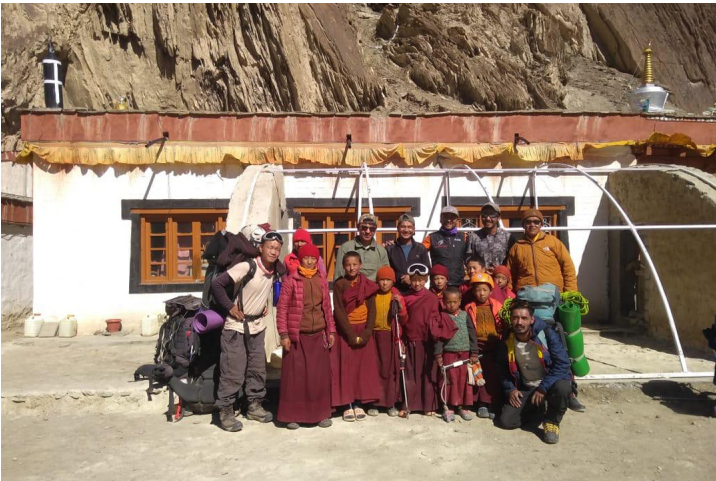
Members of the Ladakh Mountain Guides Association at the nunnery above Skitmang.