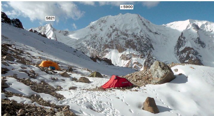
Looking south-southwest from the 5,260m camp above the Shim Dur Glacier at the unclimbed Peak 5,900m.