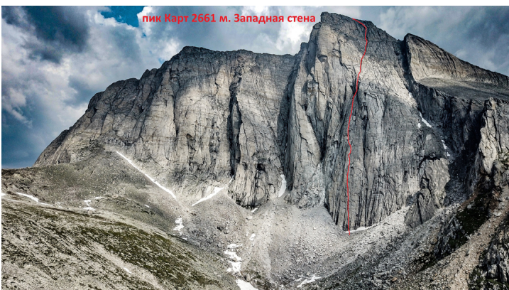
The 700-meter route on the west face of Pik Kart.