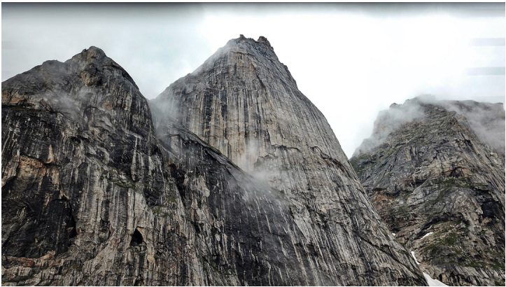
The northeast face of Sergey Glazunov Peak, climbed solo via a line on the far side of the right edge by Evgeny Glazunov.