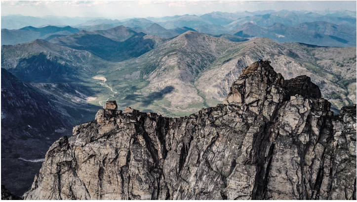
The Russian trio on the summit of Dream Peak with a lot of wild country behind.