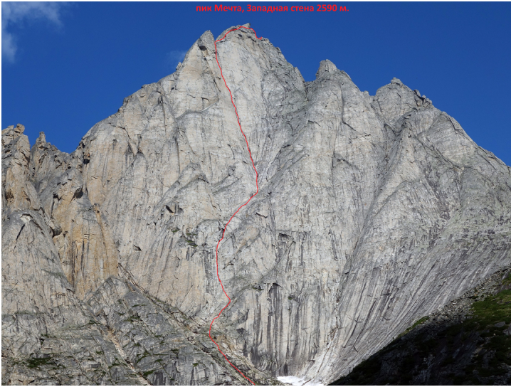
The 800-meter Russian route on the west face of Pic Mehta (Dream Peak, 2,590m).