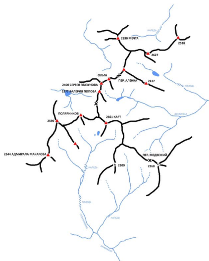
Map of the area visited by the 2019 Russian in the southwestern section of the South Muysky Ridge.