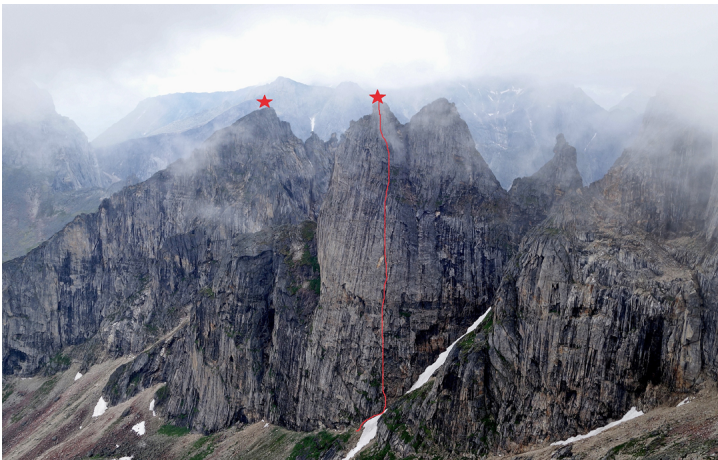
The northeast face of Sergey Glazunov Peak (2,400m) with the line of the Evgeny Glazunov route climbed solo in 2019. The peak on the left is 2,377m. Evgeny Glazunov