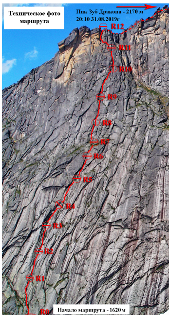
Water Route, a new line on the southwest face of the western tower of Dragon Tooth.