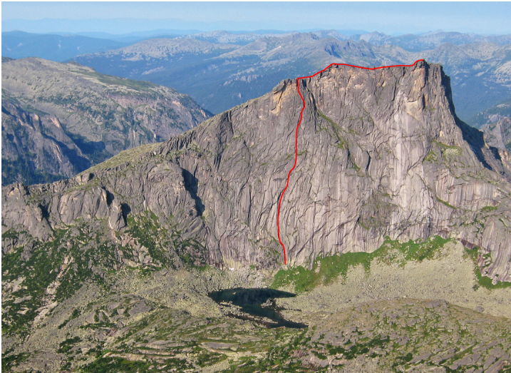
The southwest face of Dragon Tooth showing the new line Water Route.