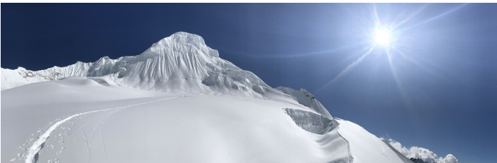
The rounded summit of Peak 6,130m seen from the northwest on the high glacier below the south face of Langshisha Ri. The French team climbed the right skyline.