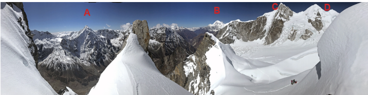
Climbing the west ridge of Peak 6,130m. (A) Urkingmang. (B) Langtang Lirung. (C) Langshisha Ri. (D) Langshisha Ri East Top.