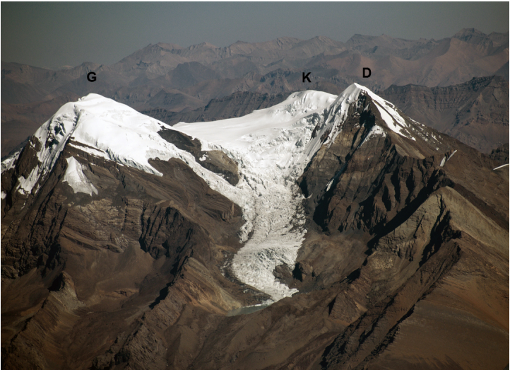
The Gyaekochen Massif from Puthi Hiunchuli to the south. (G) Gyaekochen. (K) Klang Himal. (D) Dolpo Peak.