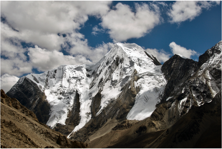
Unclimbed Gyaekochen (6,107m) from the northwest.