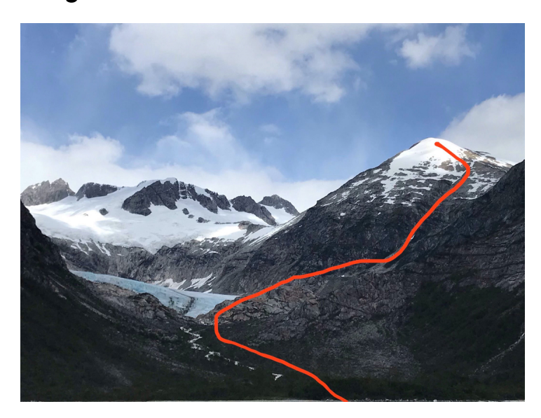
The 2020 route up the east face couloir and summit ridge on Cerro Maa Kipa (979m) in the Cordillera Darwin.