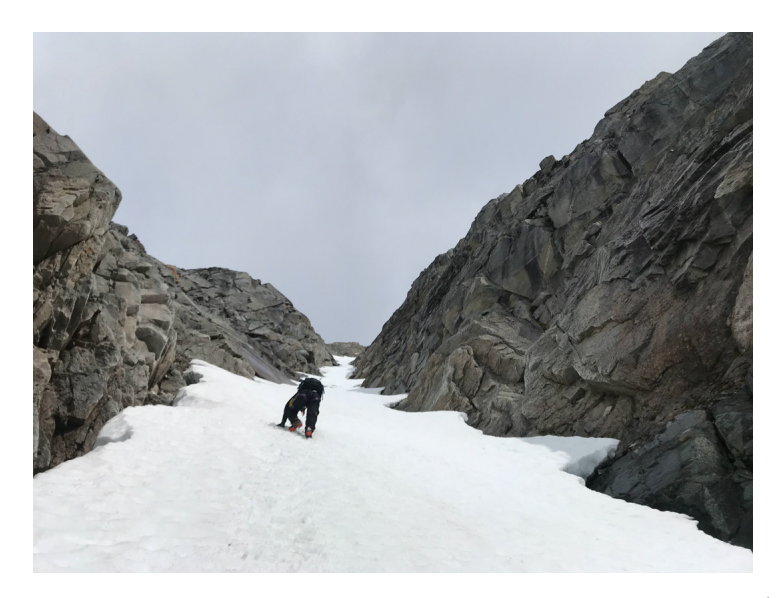
Ascending the east face couloir on Cerro Maa Kipa (979m) in the Cordillera Darwin.