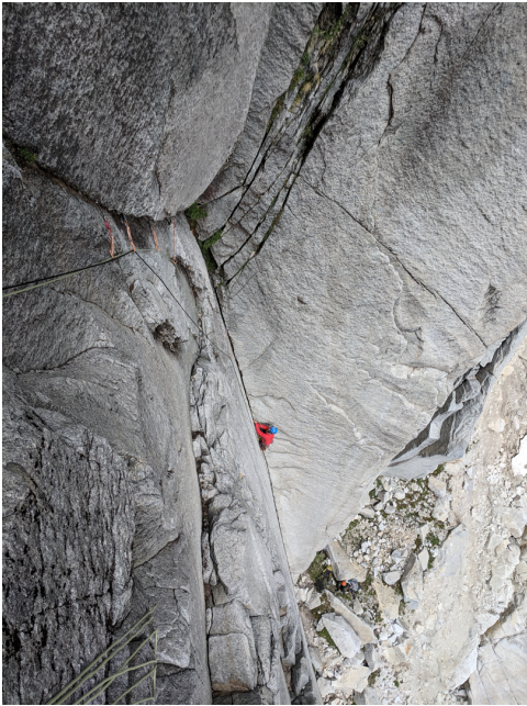
Dana Hawlish climbing the first-pitch corner of La Pluma del Cóndor on Cerro Laguna.