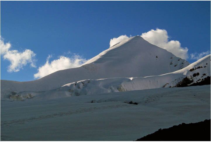
Mai Dur Sar (6,017m GPS) from the upper Northwest Gunj-e-Dur Glacier to the east. On the left is Buspur Pass. The first-ascent team in 2016 climbed to this pass then followed the gently angled ridge to the summit. Mariusz Saramak