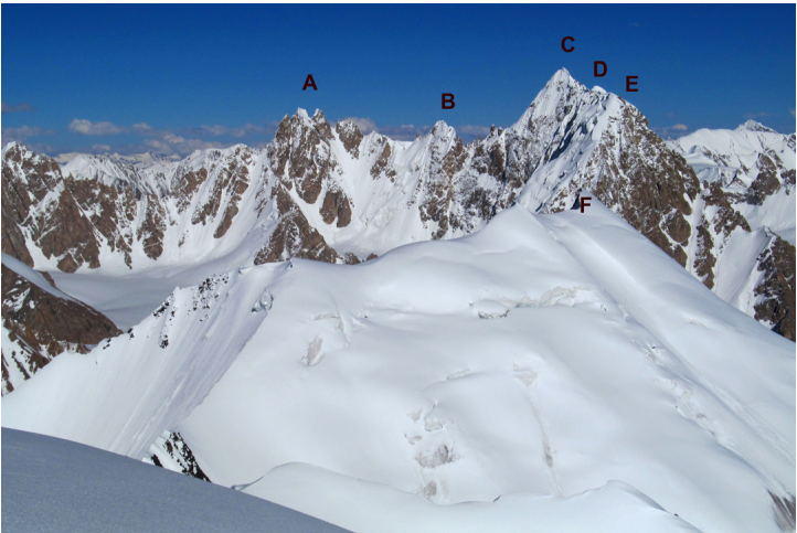
Looking east from the ascent of Mai Dur Sar in 2016 to (A) Trident Gunj-e-Sar (6,093m), (B) Point 6,000m, (C) Gunj-e-Sar Main (6,376m), (D) Gunj-e-Sar Middle (about 6,200m, climbed in 2017 by Ross Davidson and Karim Hayet and named Yad Sar), (E) Gunj-e-Sar West (6,150m), and (F) Peak 5,913m.