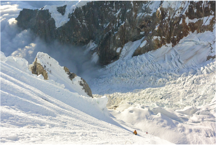
Luis Crispin and Thomas Schilter leading up the 800m ramp of 60–70° snow and ice on the direct south face of Siulá Grande.