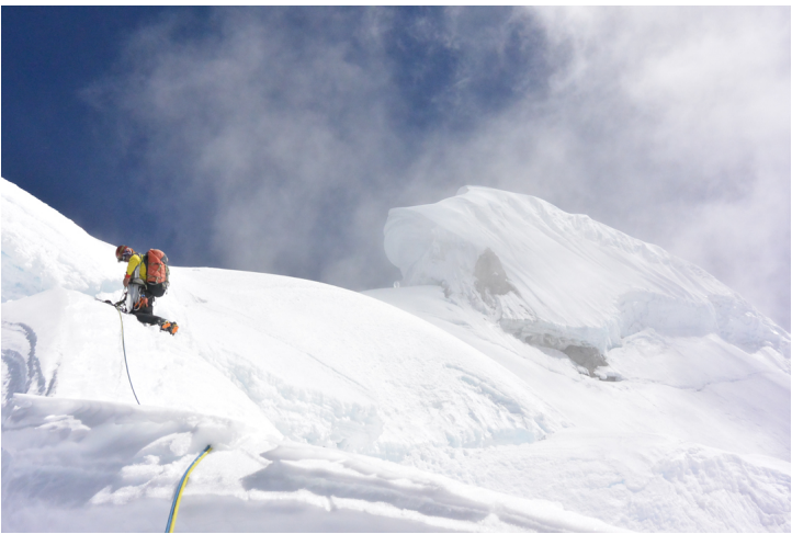
Luis Crispin on the upper shoulder of the southeast ridge of Siulá Grande.