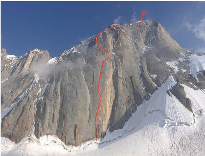
Rereading Classics on the north face of Pik Blok.