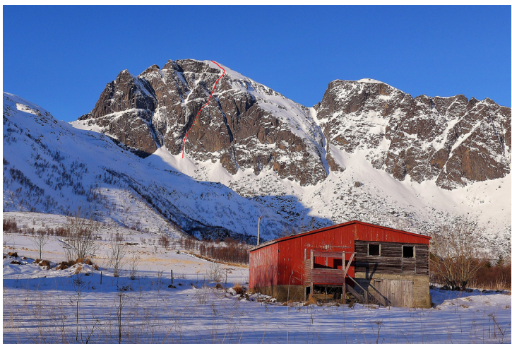
Happy Ending Gully on the east face of Haveren. This line lies between Shekina (500m, AI7 M4, Årtun-Nesheim, 2009) on the left and Arctic Mousaka (AI4, Daskalakis-Daskalakis, 2009).