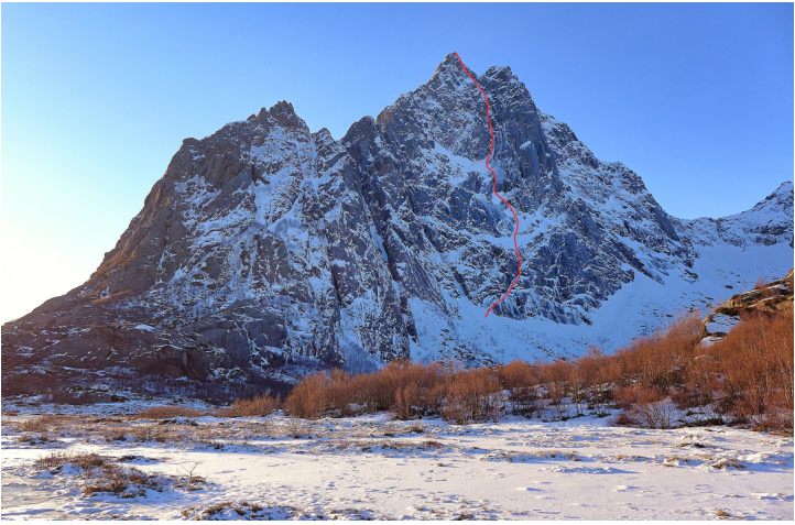
Jebanje Jeza on the northeast face of Vågakallen.