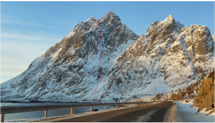
Insured by the Mafia on the north face of Solbjørn.