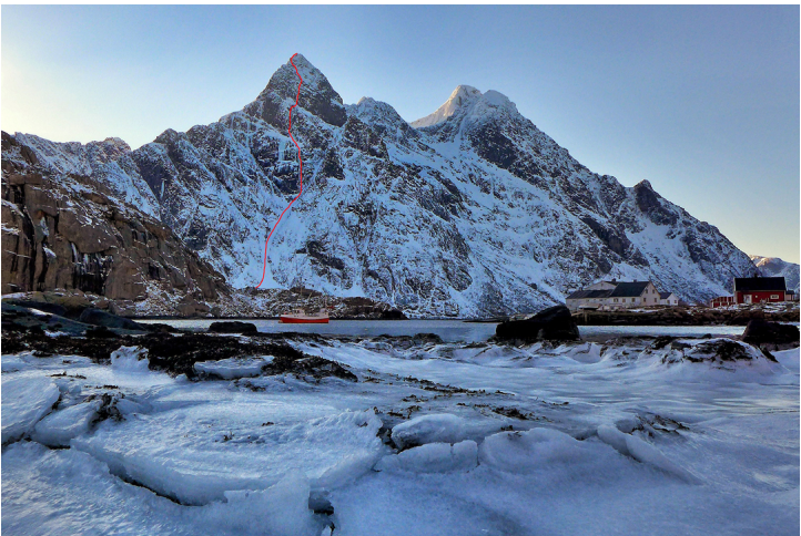
Anaconda on the north face of Himmeltindan.