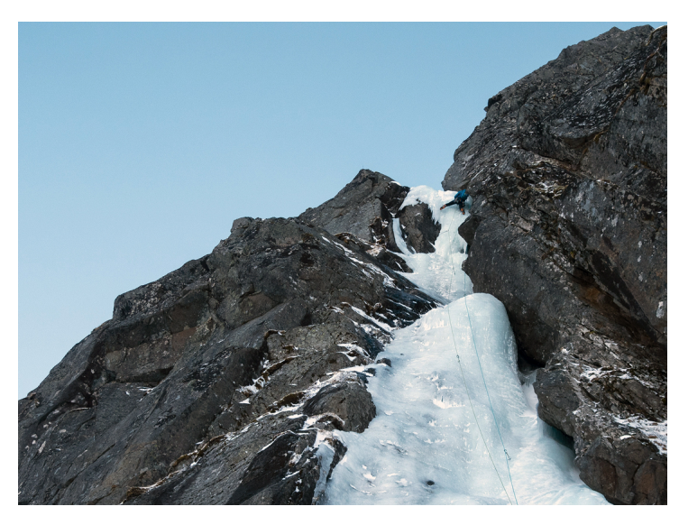
Stian Bruvoll dispatching the steep water ice pitch on Vaffelvika, Krikktindan.