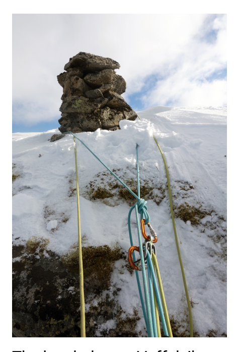
The last belay on Vaffelvika, north side of Krikktindan.