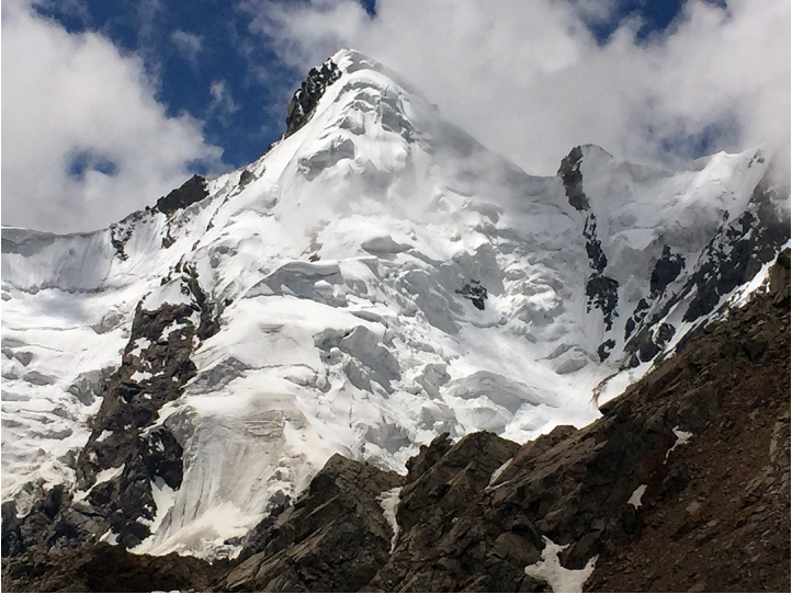
The unclimbed northeast spur of Bondit Peak (ca 6,000m).