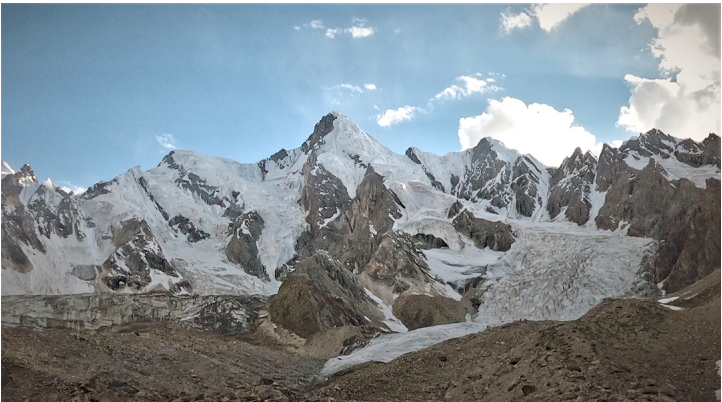
Looking west into the Bondit Cirque. Bondit Peak (ca 6,000m) is in the center, with the northeast spur in profile. The unnamed ca 5,600m peak attempted in 2019 is on the far right of the picture.