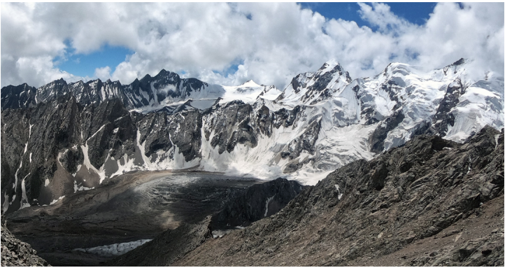
Looking south over the rim of the Bondit Valley toward the first main glacier basin south of the Kande Glacier from its entrance above Kande village. At the head of this valley, the most distant triangular snow mountain is named Raja Peak. All major summits, which have altitudes from 5,400m to 5,700m, are thought to be unclimbed, but trekking parties are regularly taken to a small point called Iqbal Top (somewhere on the nearer rock ridge), as it gives fine views of the high Baltoro peaks. Bondit Peak is just visible far right.