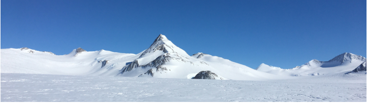
The elegant pyramid of Bogets Peak in the southern Bastien Range.