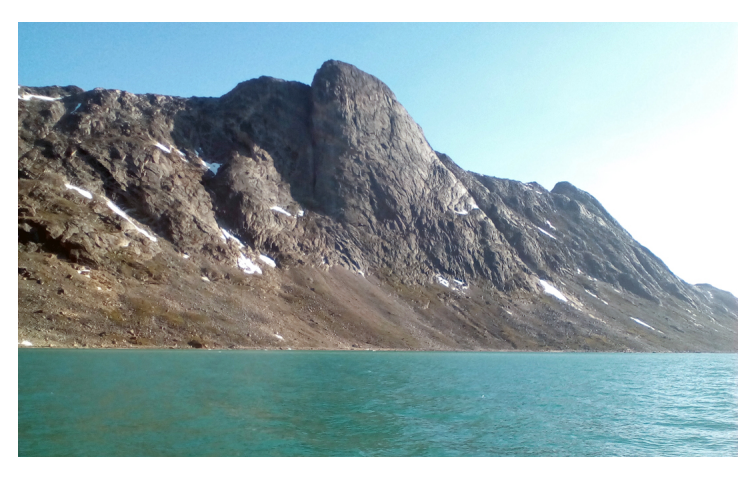
The northwest face of Peak 620m seen from the Ikateq strait. The 2019 route starts up the left side of