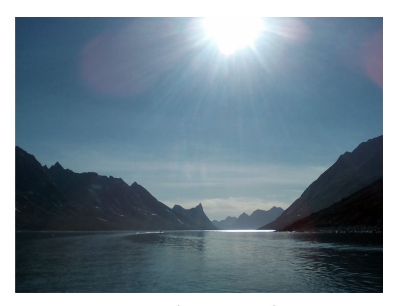
The pointed summit of Peak 620m from the northeastern end of the Ikateq strait.