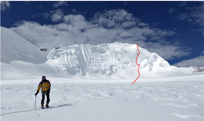
The northeast face of Hongu (6,764m) from the glacier bay below. The ridge on the left leads off picture to Hongu Chuli.