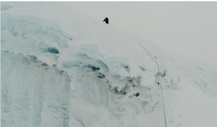
Hiroki Nakayama leading pitch six in poor weather during an ascent of the northeast face of Hongu.