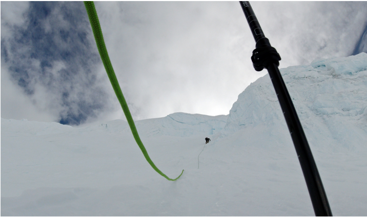
Pemba Sherpa leading pitch one on the northeast face of Hongu.