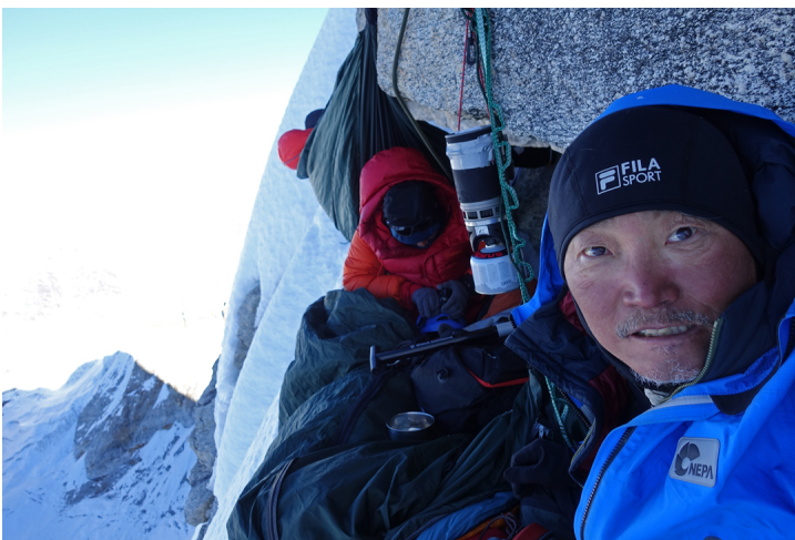
One of the bivouacs on the Korean Route on the northeast face of Peak 41.