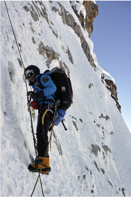
On the Korean Route, northeast face of Peak 41.