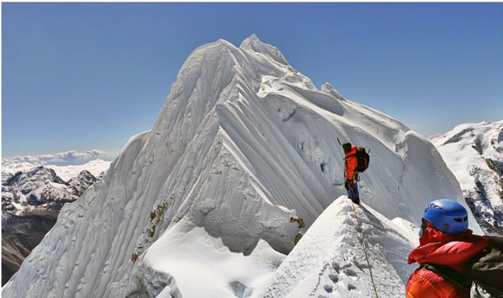
Heading for the main summit of Peak 41 during the 2016 ascent of the Korean Route.