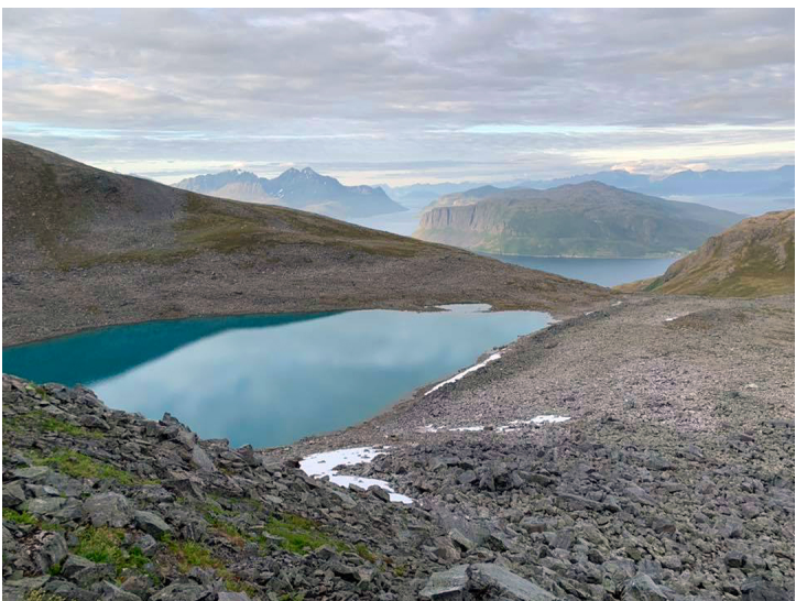
Looking northeast from Skjelettinden over the lake of Blåvannet toward the island of Kågen (distant left) and the peninsula of Vardfjellet.