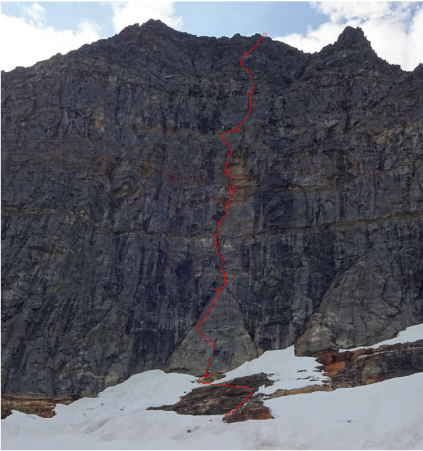
The east face of Blåtinden and the line of Uløya, Welcome to (eight pitches), the only known rock route on this wall.