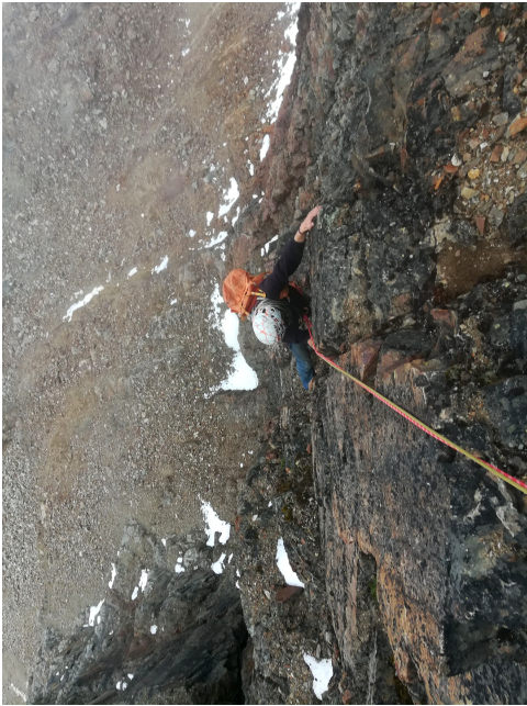
Davide Vitale near the end of the third pitch of Le Chat on Charquini.