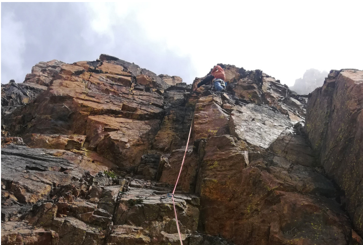
Davide Vitale on pitch two of Le Chat on Charquini.