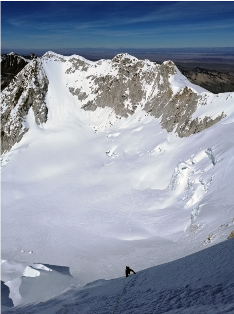
Hari Mix shortly after crossing the bergschrund, with Jakoceri in the background. The col crossed on the approach is seen close to the right edge of the image.