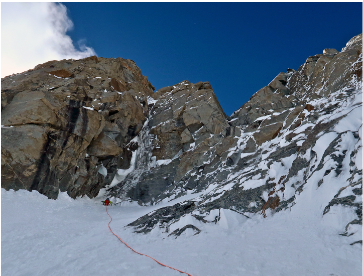
At the top of the snowfield below the start of the difficulties on the north face of Risht Peak.