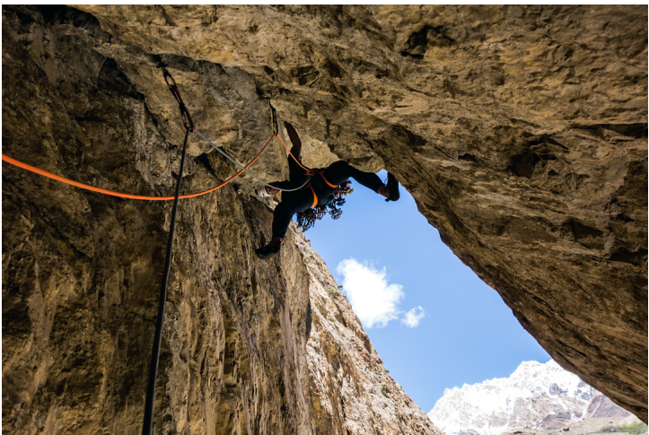
Symon Welfringer on the first ascent of Removable Crux (7b+), Yarkhun Valley.