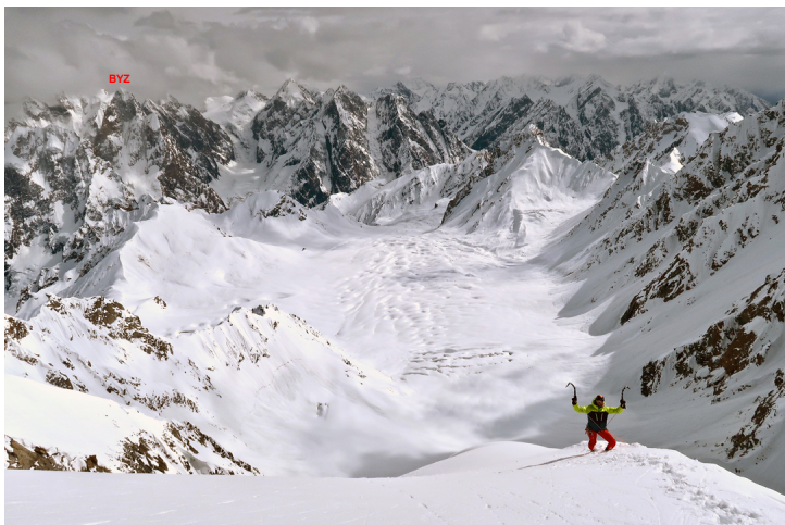
Aurélien Vaissière on the summit (southwest) ridge of Risht Peak. The view is south down the Zhang Tek Glacier with little-known peaks of the Gazen Group. The high peak marked in background left is Blatts Yaz Zom (6,191m).