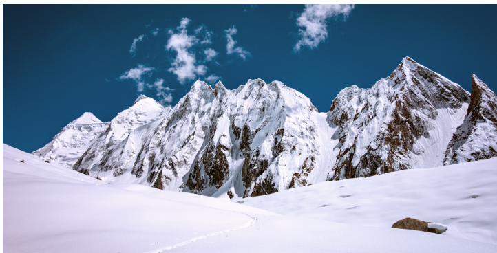
Unclimbed peaks of ca 5,600m to 5,900m on the west side of the Risht Glacier.