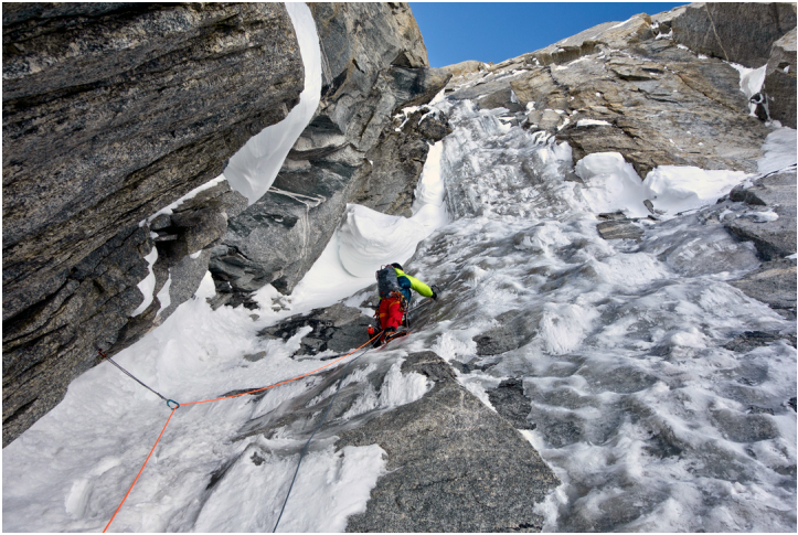
Aurélien Vaissière heading for steep ice during the first ascent of Risht Peak.