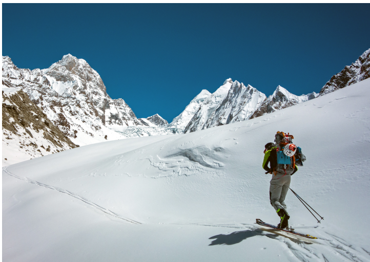
Moving up the Risht Glacier. The large peak on the left is Thui Zom II, while the pyramid right at the head of the valley is Risht Peak. The summits to the right are unclimbed.