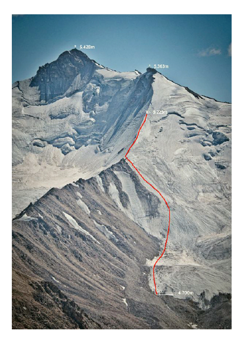
Peak 5,428m (left), above the Rivak Dara (Rivak Valley) and Sergi Ricart's attempted route in September 2018. Ricart stopped at 5,225m on the north ridge of subsummit Pik 5,363m.