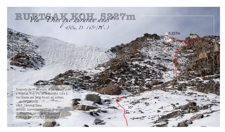
The line of Days That Will Last for Years on the east face of Rubtsak Koh (5,227m), above the Otaliok Dara (Otaliok Valley).