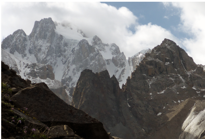
The north face of Korona (4,810m). The 2018 Pavlenko route ascends the left buttress of the high rock tower.