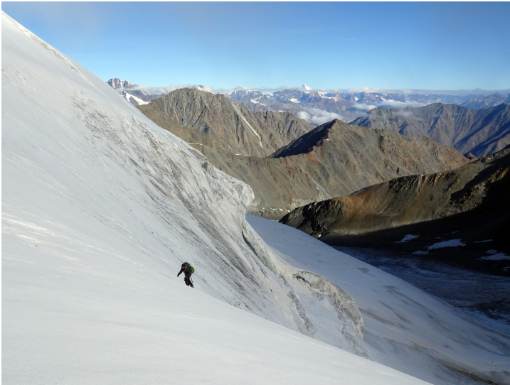
Ascending to Holmes Col before climbing the east ridge of Ache.