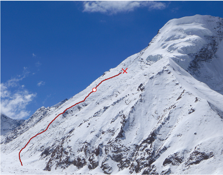
The eastern side of Kang Yatse (6,400m) with the route of the 2018 Portuguese attempt. The circle marks their bivouac site at 5,750m.