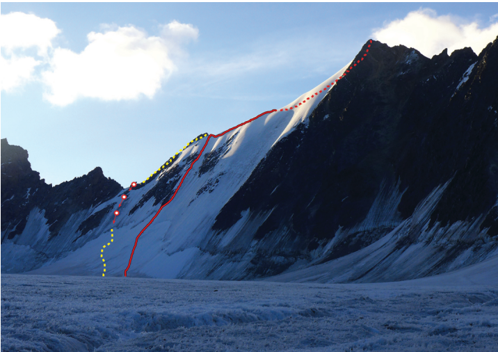
Shan Ri from the northwest. The red line marks the route of ascent, and the yellow the descent.