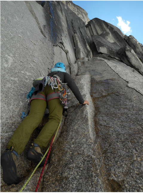
Pitch 1 of Double Double on the west face of Lost Feather Pinnacle.