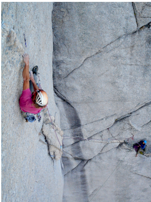
5.12 climbing up a dike on Guy Like You, Snowpatch Spire.