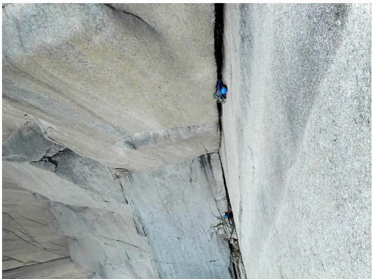
The offwidth-squeeze on Guy Like You, Snowpatch Spire.