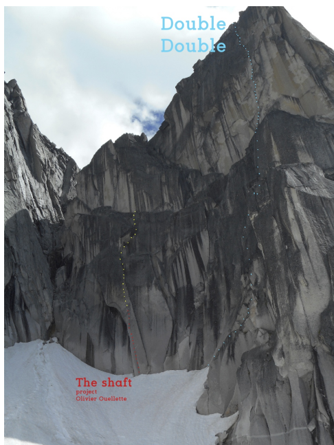
The west face of Lost Feather with the line of Double Double and an incomplete route.