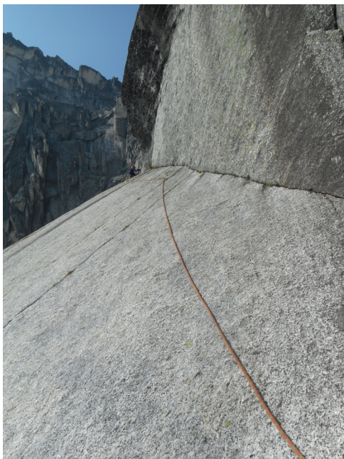
Third pitch of Fat Albert on Prince Albert Tower.