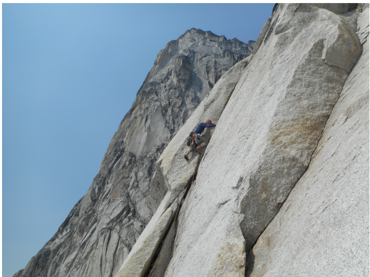
First pitch of Fat Albert on Prince Albert Tower.