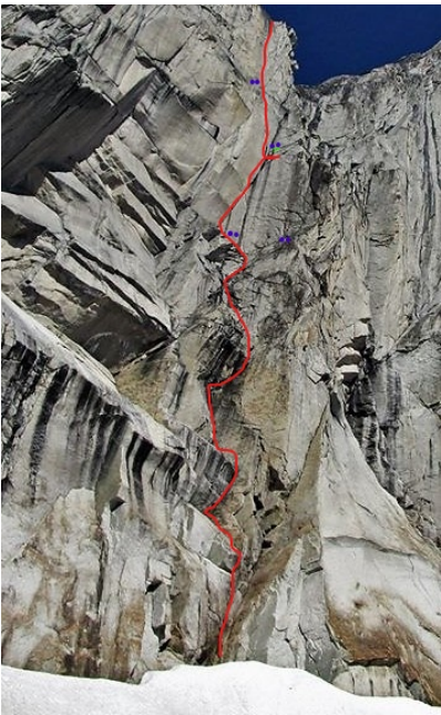
The line of Guy Like You on Snowpatch Spire.