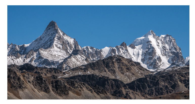
Unclimbed peaks of the Limi Himal, both close to 6,000m and close to Limi Koti.