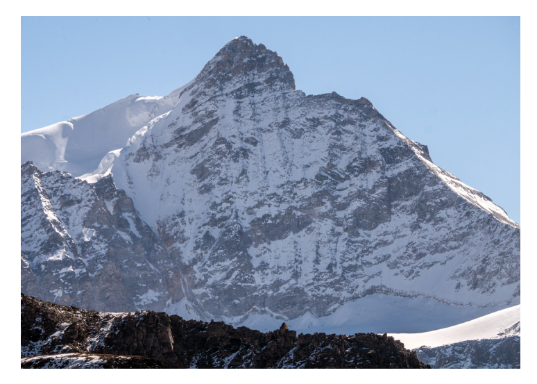
An unclimbed mixed face in the Limi Himal.