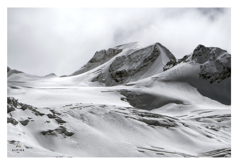
The highest summit in the center is Shikhan Ri, climbed in 2018 by the snow slopes descending to the left.

Looking south up the Nying Glacier to the mountains of Nyalu Lek. (A) Nying Himal (6,140m). (B) A broad summit of around 5,700m. (C) Unnamed peak attempted in 2018 to within 40m of summit. (D) Small tooth climbed in 2018 by French party. (E) Shikhan Ri (ca 5,880m, climbed in 2018). (F) Peak 5,975m. (G) French advanced base camp.