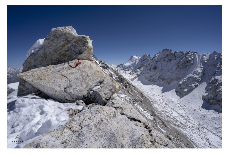
The summit of Steph Himal, looking southeast up the valley to the south, with the far distant snowy summit (through the gap) of Peak 6,084m (unofficially known as Sumdo Himal). The rope sling was left by the French first ascensionists as a discreet legacy of their visit.