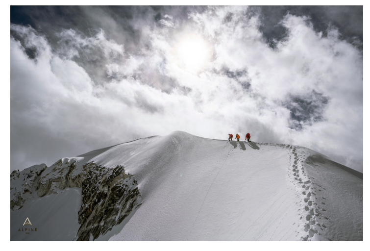
Approaching the summit of Shikhan Ri on the first ascent.