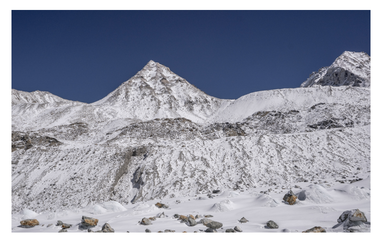
Steph Himal from the Nying Valley. The 2018 route climbed directly up the (west) face pointing toward the camera.