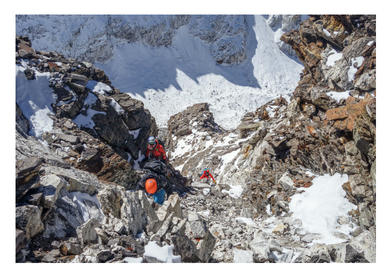
Climbing rotten rock near the top of the south face of Phasang during the first ascent.