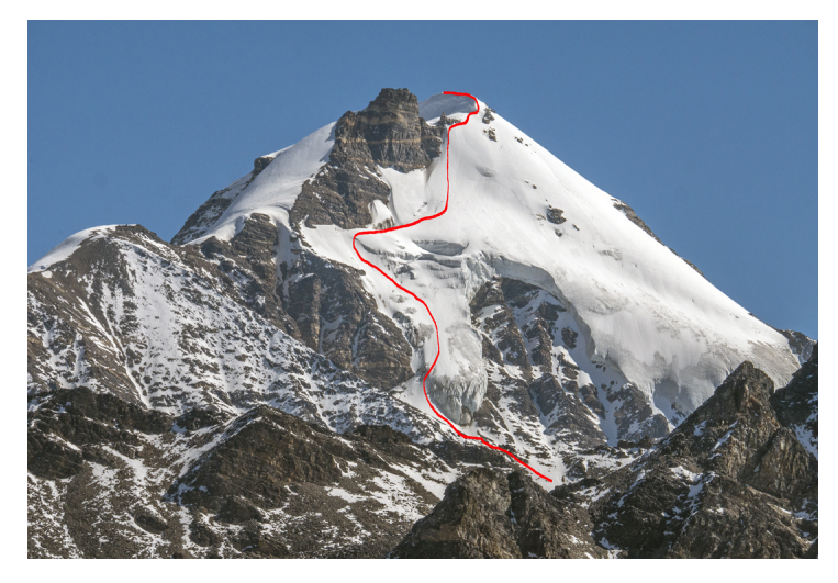
Limi Koti (6,194m) and the route of ascent up the southwest face and west ridge.