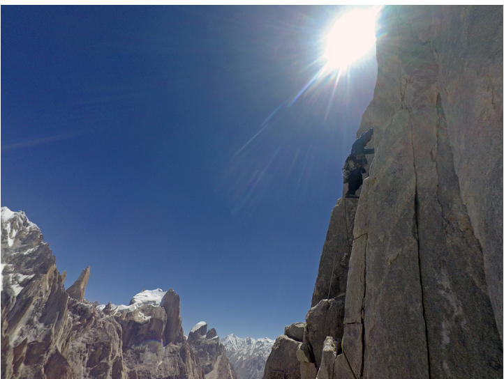
Jonathan Schaffer on Hainabrakk East Tower with Trango Tower and Great Trango behind.