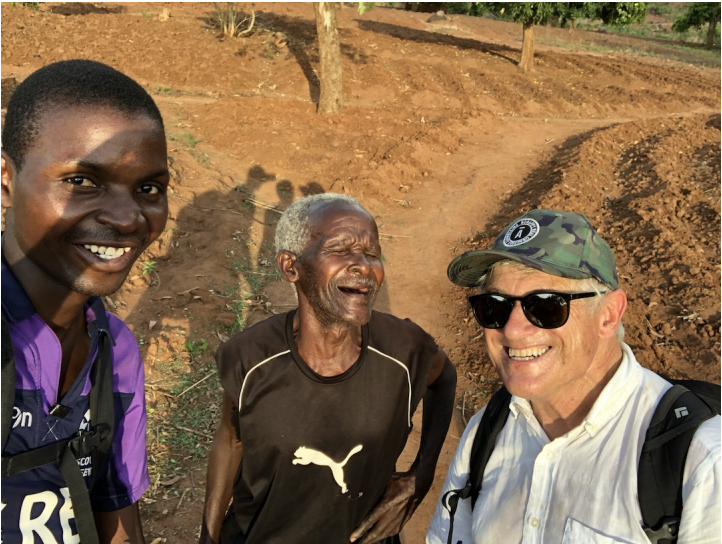
The team receiving the blessing of the village chief below Chambe.