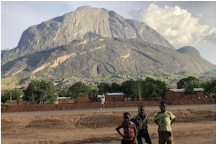
New Route on Chambe