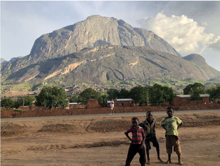
The lower and upper northwest face of Chambe. With a total height of more than 3,000 feet, the potential is huge.