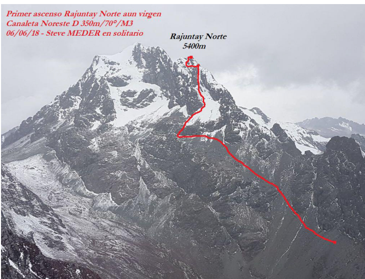
A zoomed-out view of the northeast couloir route (350m, D 70° M3) on Rajuntay Norte (ca 5,400m).