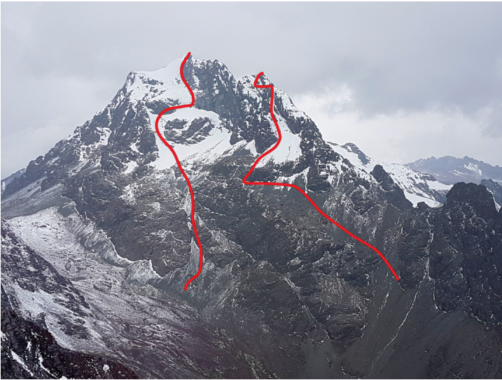
(Left) The May 2018 route on the northeast face of Rajuntay (5,477m). (Right) The June 2018 northeast couloir route (350m, D 70° M3) on Rajuntay Norte (ca 5,400m) Steve Meder