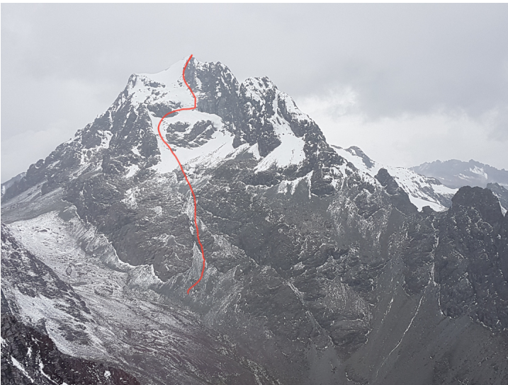
The solo new route on the northeast face of Rajuntay (5,477m) climbed in May 2018.