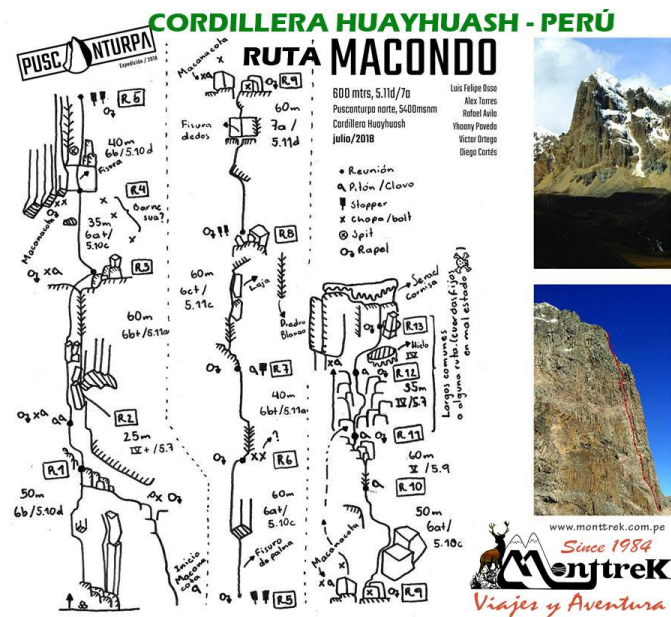
A detailed photo-topo of Macondo (600m, 7a), the Colombian route on the north-northwest face of Puscanturpa Norte (5,652m).